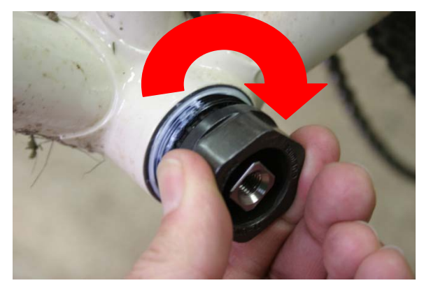
Fig.7 Tighten non-drive side cup, clockwise.

3. The non-drive side cup is the cup with the silver adjustable lock ring. Remove the lock ring from the cup. Thread the cup in a clockwise direction until the bearing is snug up against the bottom bracket spindle; do this gently (Fig.7). Just as the cup gets difficult to turn and it feels like the bearing is binding STOP and back the cup off about an 1/8 of a turn. Thread the lock ring onto the cup in a clockwise direction. The flat side of the lock ring should rest against the bottom bracket shell, with the beveled side facing outward (Fig.8). Use the bottom bracket lock ring tool to tighten lock ring against the bottom bracket shell, while preventing the cup from rotating with the bottom bracket cup tool (Fig.9). If you allow the cup to rotate as you tighten the lock ring, two things can happen: 1) the cup will not be locked in place and may come loose while riding and 2) you may preload the bearing too much, ruining it after only a moderate amount of use.