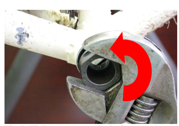
Fig.4 Tighten counter-clockwise.