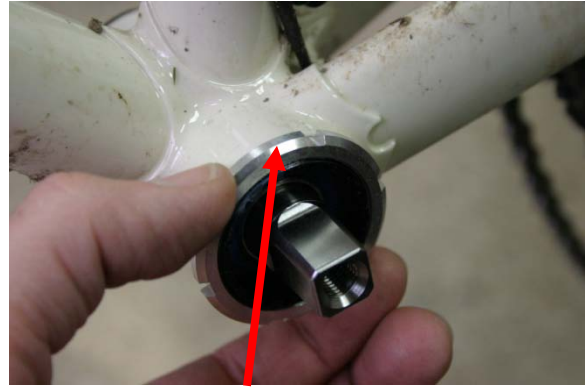
Fig.8 Beveled edge faces outward.