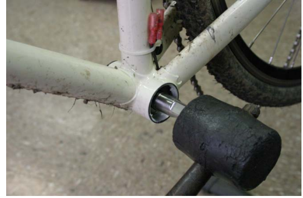
Fig.6 Gently tapping spindle into place.

3. The non-drive side cup is the cup with the silver adjustable lock ring. Remove the lock ring from the cup. Thread the cup in a clockwise direction until the bearing is snug up against the bottom bracket spindle; do this gently (Fig.7). Just as the cup gets difficult to turn and it feels like the bearing is binding STOP and back the cup off about an 1/8 of a turn. Thread the lock ring onto the cup in a clockwise direction. The flat side of the lock ring should rest against the bottom bracket shell, with the beveled side facing outward (Fig.8). Use the bottom bracket lock ring tool to tighten lock ring against the bottom bracket shell, while preventing the cup from rotating with the bottom bracket cup tool (Fig.9). If you allow the cup to rotate as you tighten the lock ring, two things can happen: 1) the cup will not be locked in place and may come loose while riding and 2) you may preload the bearing too much, ruining it after only a moderate amount of use.