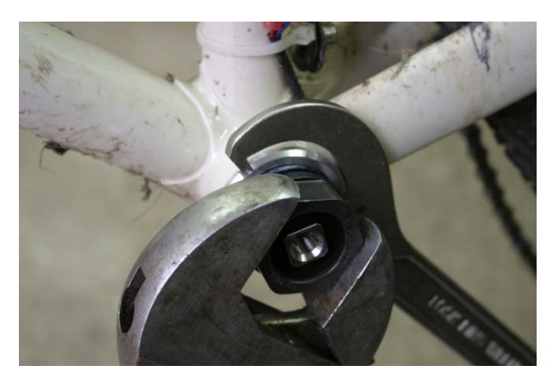
Fig.9 Hold cup while lock ring is tightened.

4. Spin the bottom bracket spindle with your hand. You may feel some slight drag from the seals, but the spindle should rotate very smoothly. If you feel any binding/roughness or excessive drag, then the non-drive side cup is too tight and must be adjusted. Try and push the spindle from side to side with the palms of your hands (Fig.10), if you detect any movement from left to right then the bearings may not be fully seated against the shoulders in the spindle and the non-drive side cup may need to be tightened. Grasp the ends of the spindle with your hands and try to move the spindle forward and backward (Fig.11), if you detect any play then the non-drive side cup will need to be tightened.