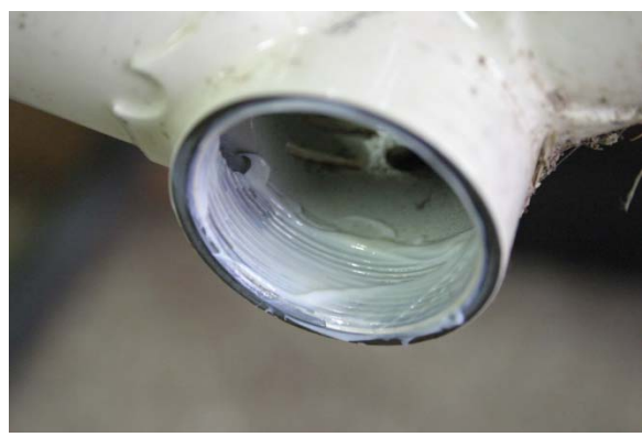
Fig.2 Greased threads.

Grease the threads of each bottom bracket cup. Grab the drive side cup: this is the cup with a machined shoulder that is part of the cup (Fig.3). To install, thread the drive side cup in a counter clockwise direction into the drive side of your frame's bottom bracket shell (Fig.4). Thread the cup into the bottom bracket shell until the machined shoulder contacts the shell. Once the cup's shoulder contacts the shell, you can tighten about another 1/8-1/4 turn and you're finished with that side. Don't over-tighten the cup, there's no need....trust us on this.