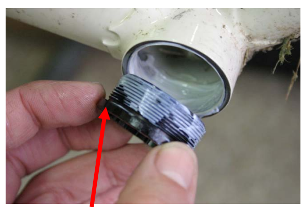
Fig.3 Machined shoulder of drive side cup.

Grease the threads of each bottom bracket cup. Grab the drive side cup: this is the cup with a machined shoulder that is part of the cup (Fig.3). To install, thread the drive side cup in a counter clockwise direction into the drive side of your frame's bottom bracket shell (Fig.4). Thread the cup into the bottom bracket shell until the machined shoulder contacts the shell. Once the cup's shoulder contacts the shell, you can tighten about another 1/8-1/4 turn and you're finished with that side. Don't over-tighten the cup, there's no need....trust us on this.