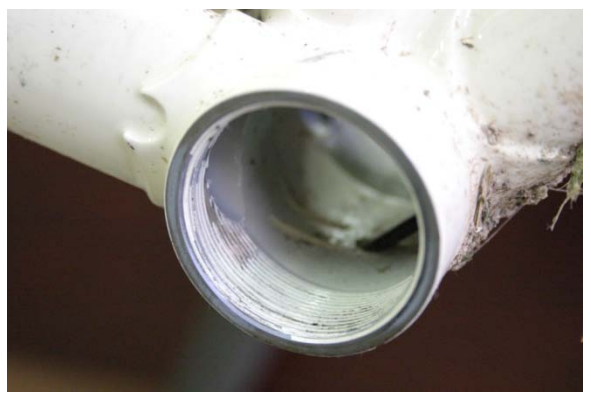
Fig.1 BB threads clean and ready for install.

1. Make sure that the threads in your bottom bracket are clean and greased (Fig.1 and 2). NOTE: It may be necessary to chase the bottom bracket threads and have each side of the bottom bracket faced in order to insure that the bottom bracket can be installed and adjusted properly. Your local bike shop has the tools to do this if you don't.