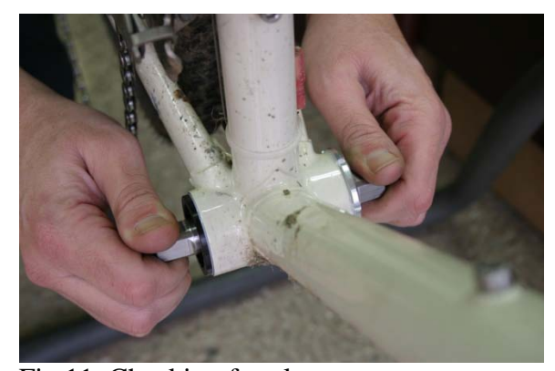
Fig.11 Checking for play.

Eliminate as much play as you can while allowing the spindle to spin freely and smoothly. If the bottom bracket is adjusted too tight and ridden, the bearings will be ruined very quickly. If you do not feel confident in your ability to install and setup the bottom bracket properly, please take it and your bike to your local bike shop and have a mechanic do the installation for you.